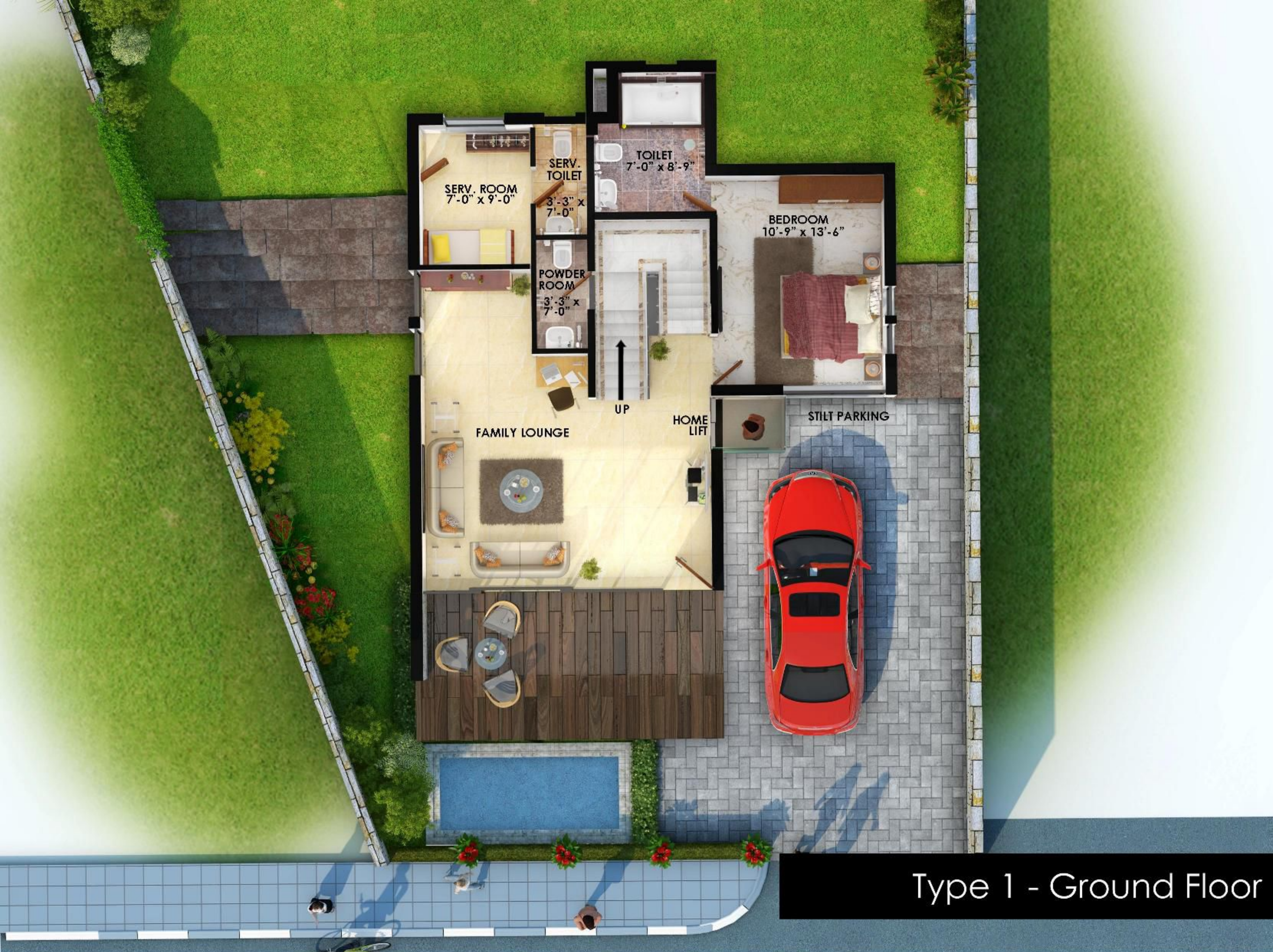
Type 1 - Ground Floor

DEVELOPERS: SHAH & SOMPUA & CO. KHANDALA