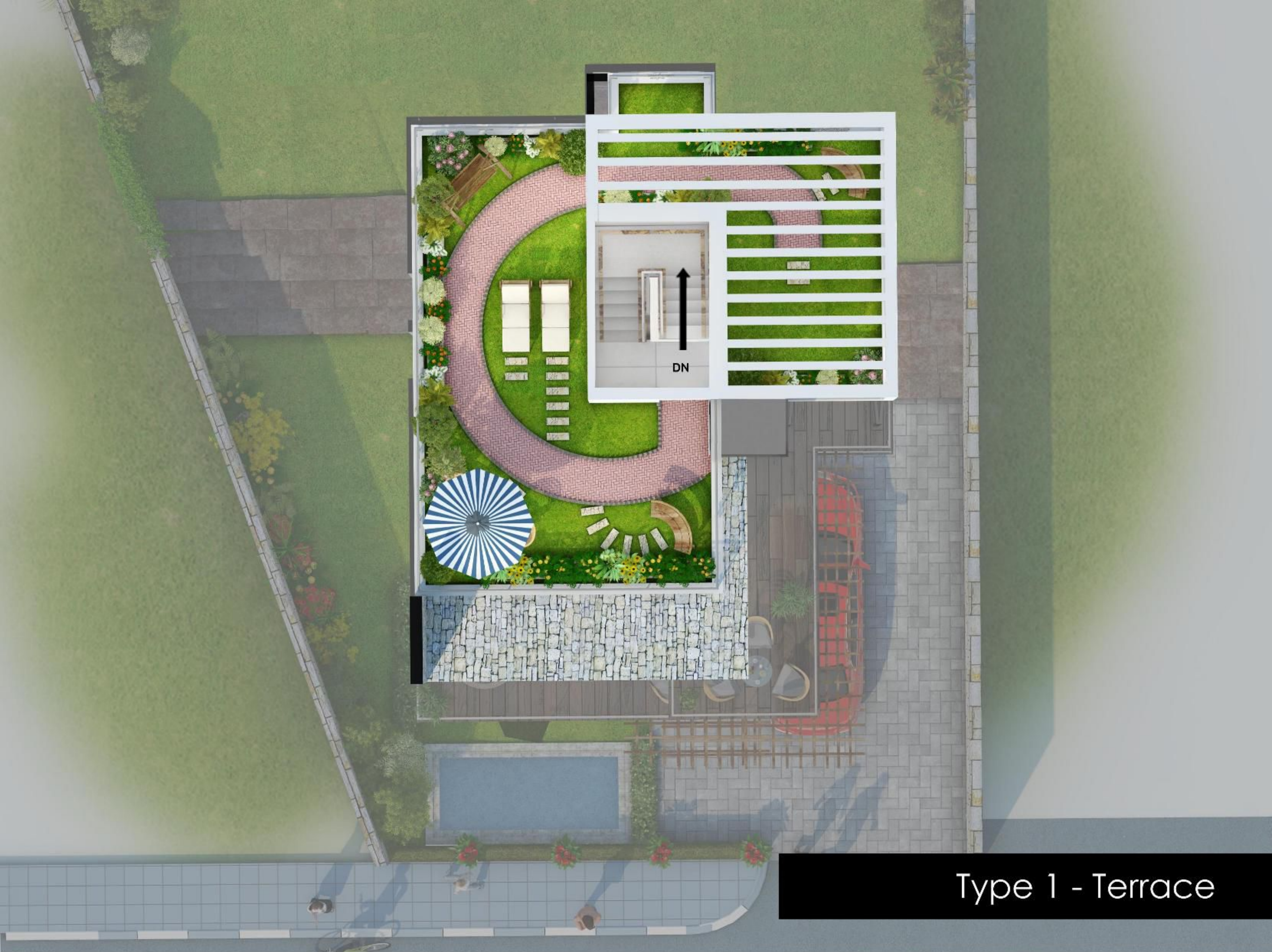
Type 1 - Terrace

DEVELOPERS: SHAH & SOMPURA & CO. KHANDALA