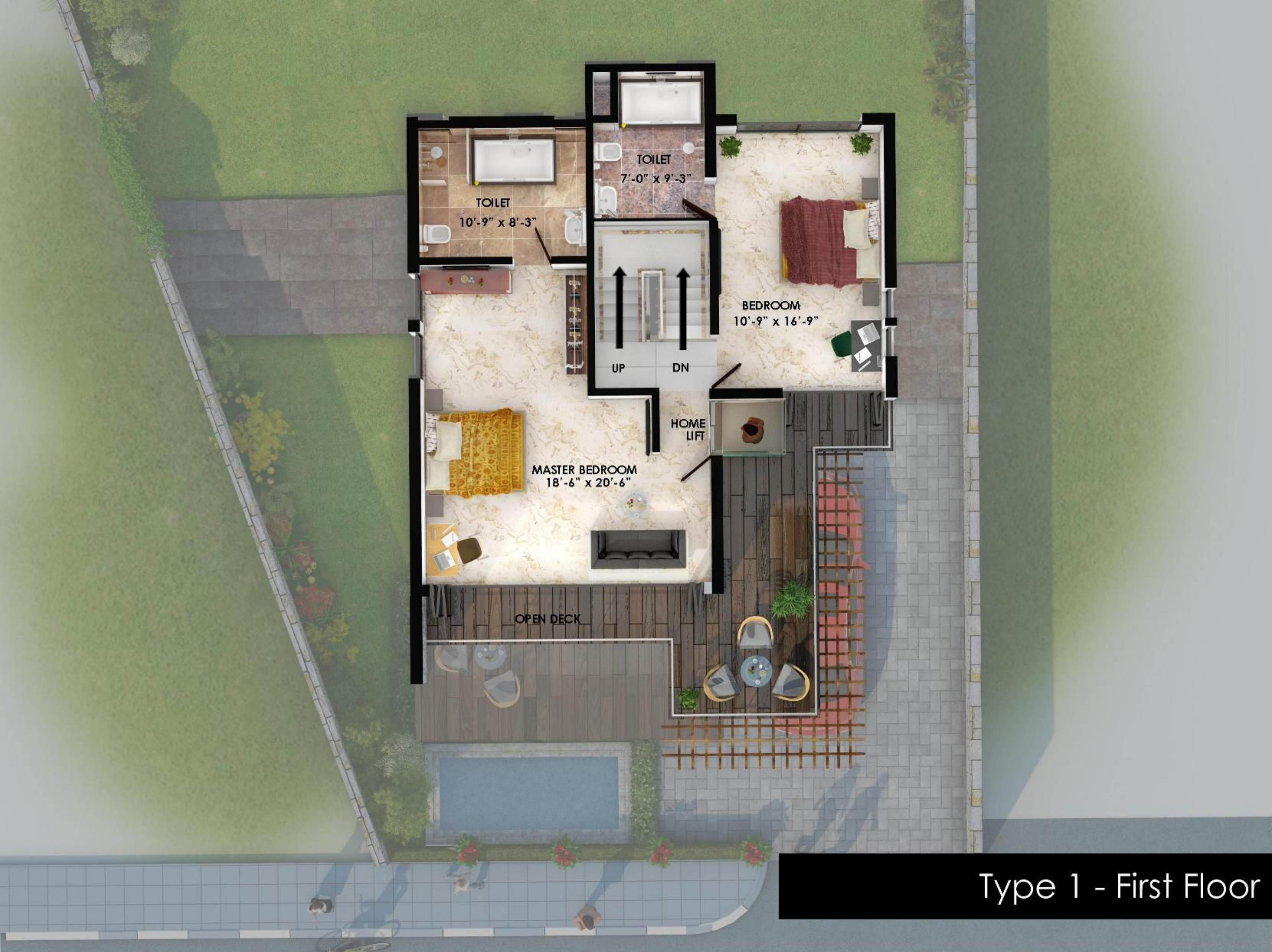
Type 1 - First Floor

DEVELOPERS: SHAH & SOMPURA & CO. KHANDALA