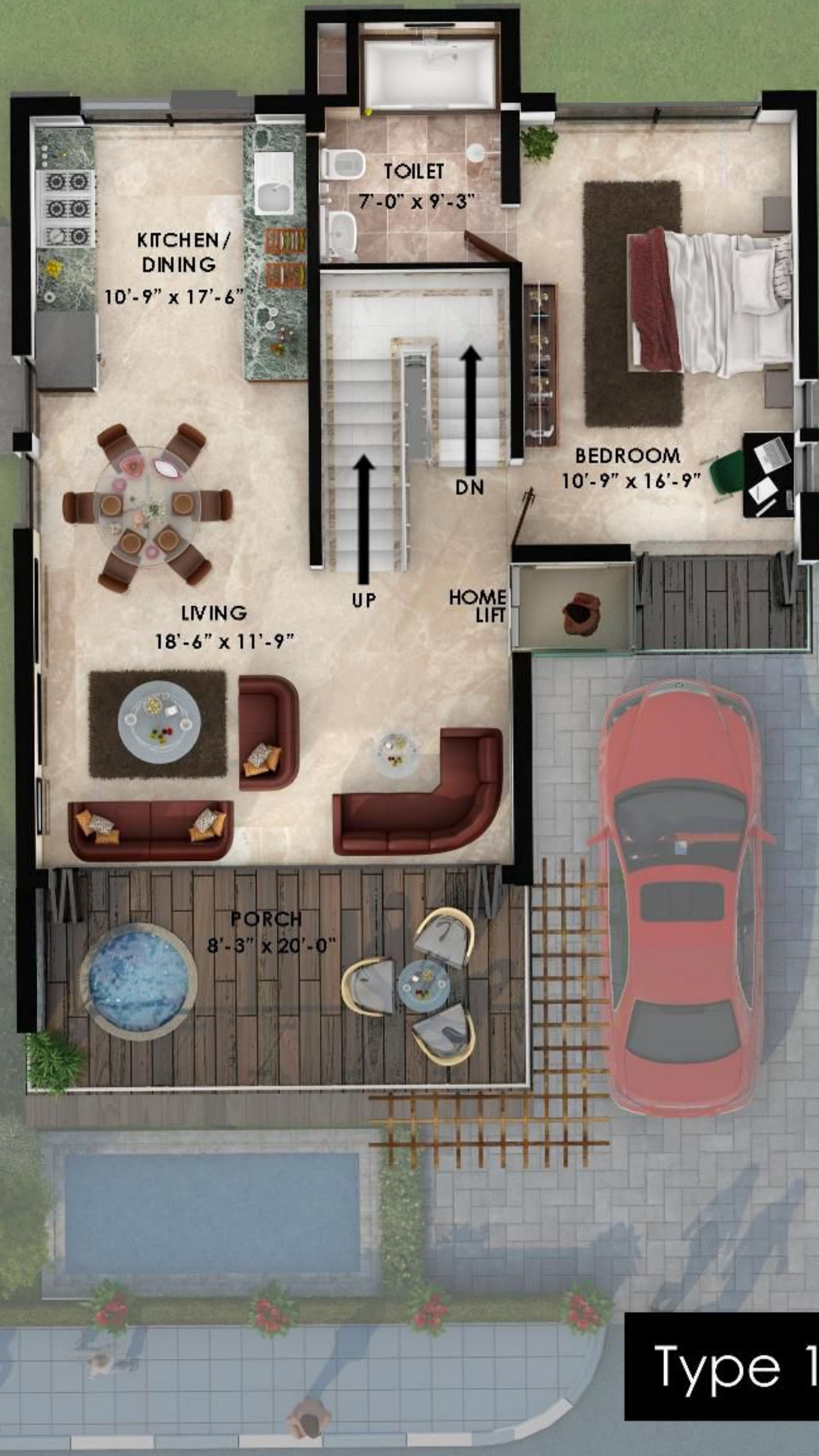
Type 1 - Upper Ground Floor

DEVELOPERS: SHAH & SOMPURA & CO. KHANDALA